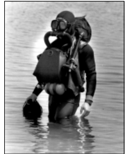
Figure 18-1. Diver in Draeger LAR V UBA.

The term closed-circuit oxygen rebreather describes a specialized type of underwater breathing apparatus (UBA). In this type of UBA, all exhaled gas is kept within the rig. As it is exhaled, the gas is carried via the exhalation hose to an absorbent canister through a carbon dioxide-absorbent bed that removes the carbon dioxide by chemically reacting with the carbon dioxide produced as the diver breathes. After the unused oxygen passes through the canister, the gas travels to the breathing bag where it is available to be inhaled again by the diver. The gas supply used in such a rig is pure oxygen, which prevents inert gas buildup in the diver and allows all of the gas carried by the diver to be used for metabolic needs. Closed-circuit oxygen UBAs offer advantages valuable to special warfare, including stealth (no escaping bubbles), extended operating duration, and less weight than open-circuit air scuba. Weighed against these advantages are the disadvantages of increased hazards to the diver, greater training requirements, and greater expense. However, when compared to a closed-circuit mixed-gas UBA, an oxygen UBA offers the advantages of reduced training and maintenance requirements, lower cost, and reduction in weight and size.